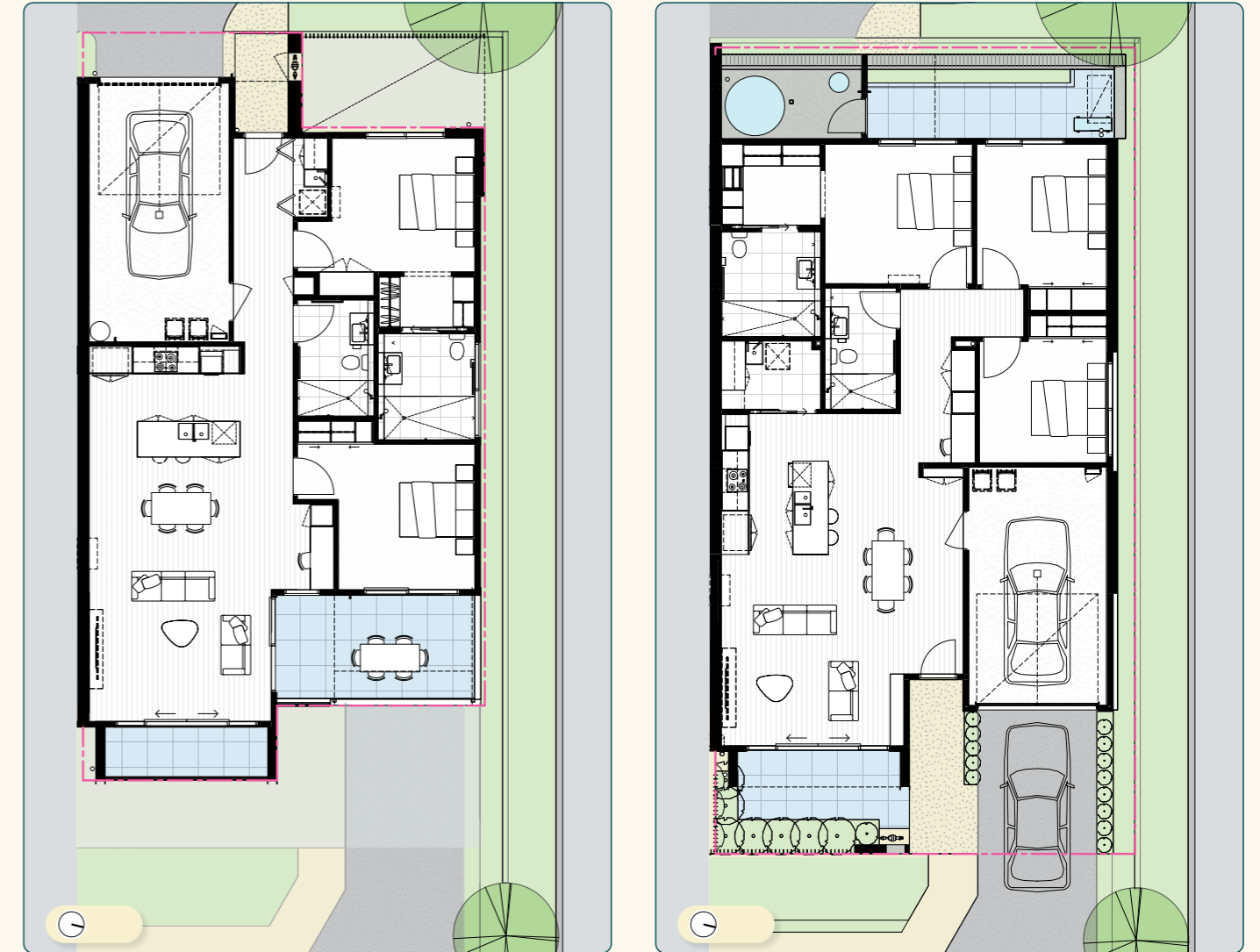
single level 2 & 3 bedroom villas